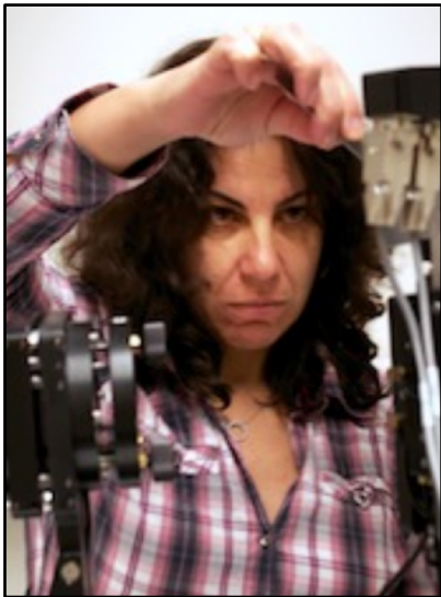
Optical Properties of the Electron Gas Vanya Darakchieva Linköping University